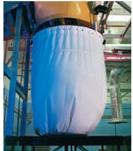
Cost-effective autoloader (clean side) station