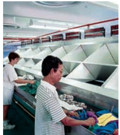
Non-interrupt sort-to-belt system